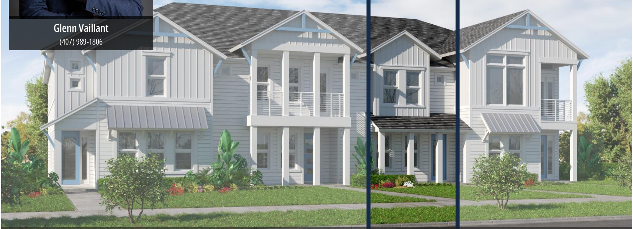
THE DELEON - D at NOCATEE