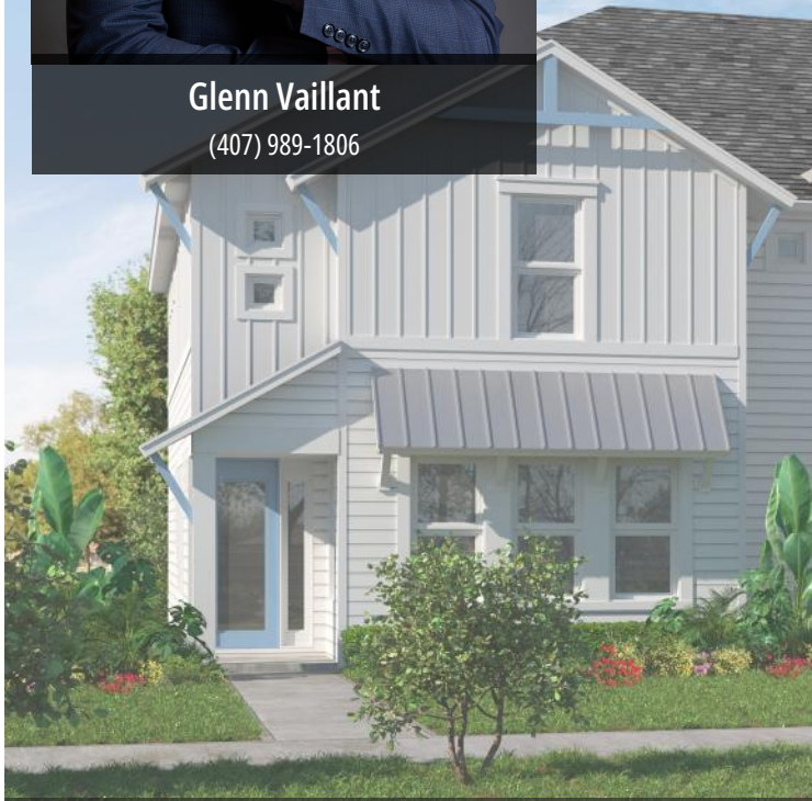
THE CASTILLO - C at NOCATEE