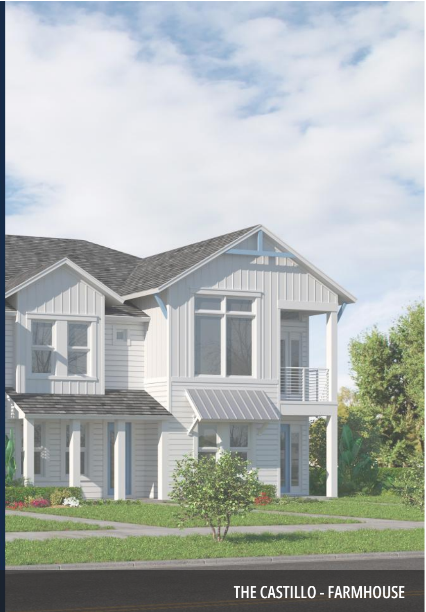
THE CASTILLO - FARMHOUSE

3 Bedrooms • 2.5 Bathrooms • 2-Car Garage • 1,680 ft 2 Living Area • 2,306 ft 2 Under Roof